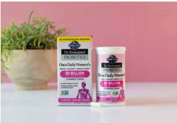
Garden of Life SELECT SUPPLEMENTS 30% OFF