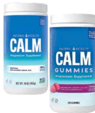
Natural Vitality ALL MAGNESIUM SUPPLEMENTS 25% OFF