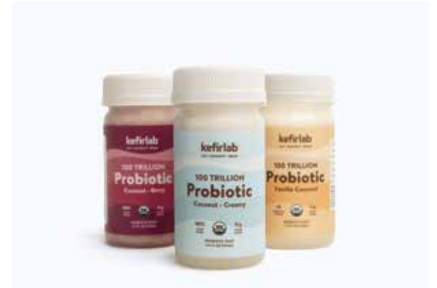
Kefir Lab ALL PROBIOTICS 20% OFF