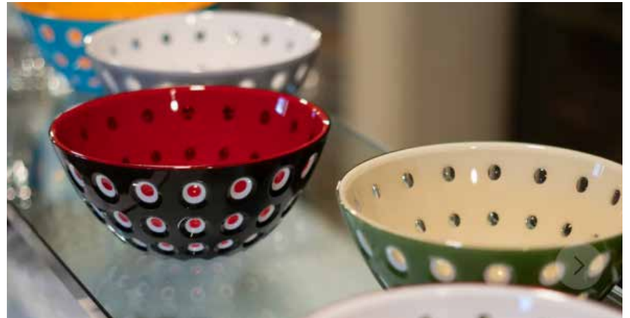
Guzzini TABLEWARE Selected Varieties