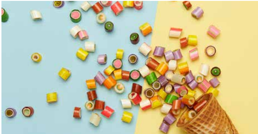
Candylabs CANDY Selected Varieties